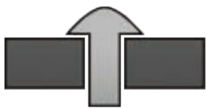
1/2:1 AKS robo-kut